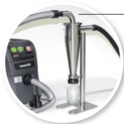
Especially convenient: direct exhaust into the sample glass

Cool, clean and convenient: FRITSCH Cyclone separators for sample exhaustion open up new possibilities, which would otherwise be impossible. Their powerful airflow ensures simple feeding and faster throughput. Due to faster operation and the additional stronger cooling, the thermal load of the sample materials is minimized, so that temperature-sensitive samples can also be ground without any problems.