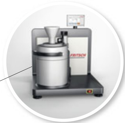
Simple connection to the PULVERISETTE 14 premium line

Samples which are difficult to grind or extremely temperature-sensitive (e.g. plastics) can be embrittled with the addition of liquid nitrogen and subsequently ground in the PULVERISETTE 14 premium line .