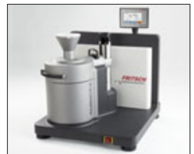
Intelligent AutoLOCK grinding chamber enables incredibly simple operation