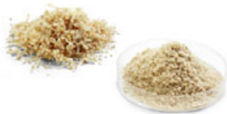
Optimal preparation of a wood sample with the cutting rotor

Turn your PULVERISETTE 14 premium line into a Cutting Mill with just a few simple motions for fast, efficient pre-grinding of fibrous materials and plastics: Simply insert the cutting rotor with cooling fins with the appropriate accessories such as the collecting vessel, labyrinth disk and sieve ring – the materials are ground by cutting and shearing forces. The PULVERISETTE 14 premium line will detect the labyrinth disk and automatically operate in an optimised mode as a Cutting Mill with up to 10,000 rpm. The desired final fineness will also be determined here by the selected sieve ring with trapezoidal or round perforation. And the use of a FRITSCH Cyclone separator will further improve throughput and cooling.