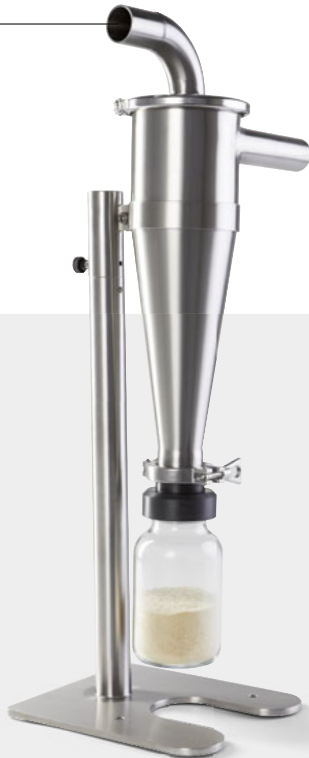
Compact and powerful: the FRITSCH high-performance Cyclone separator made of stainless steel

The powerful airflow enables the use of finer sieve rings to achieve a higher final fineness – even for materials, which are otherwise difficult to grind finely, such as electrostatically-charged plastics or powder coatings. Especially convenient: the ground sample is drawn directly into the screwed-on sample glass, in which it can be transported, stored and easily removed for analysis.