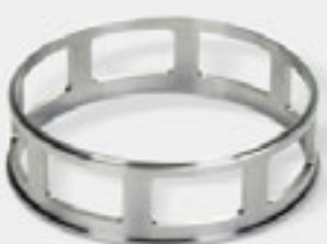
Impact bar for gentle comminution

The FRITSCH impact bar is the ideal solution for very gentle grinding of especially heat-sensitive materials such as powder coatings or plastics as well as for the smooth pre-crushing and fine comminution of hard-brittle to soft, fatty or samples with residual moisture. The impact bar acts as a stator on which the material is additionally beaten. The result: increased grinding performance for a particularly fast and efficient grinding that minimises the thermal load. The corresponding impact rotor and a special sieve ring for the impact bar must be ordered separately.