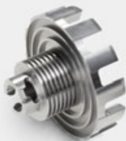
Impact rotor with cooling fins

The strong airflow produced by the motor, an ingenious air routing, as well as special cooling fins on the rotors further intensify cooling. Your advantage: melting or sticking is greatly reduced, even with temperature-sensitive samples. The cooling function can easily be enhanced further by utilizing the integrated option to connect an exhaust system or a FRITSCH Cyclone separator.